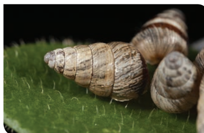
Small pointed snail.