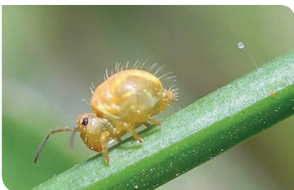
Lucerne flea.