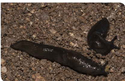
Black keeled slug.