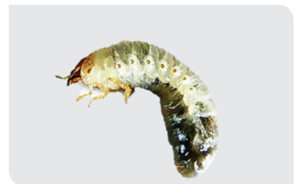
African black beetle (ABB) larva.