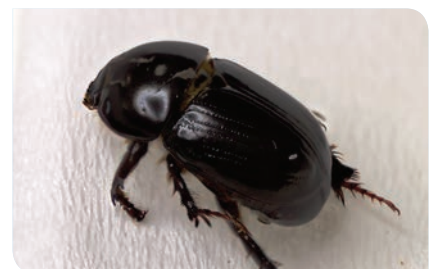
African black beetle (ABB) adult

Main image: African black beetle.